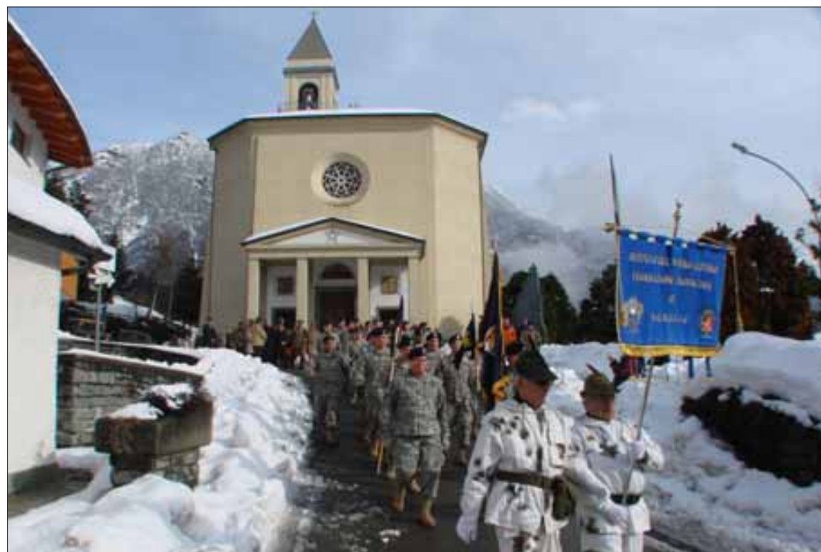
Italians and Americans joined forces to pay homage to their fallen comrades from both world wars in the village of Chiesa. Italian veterans' associations hosted the U.S. Army Reserve SETAF Augmentation Unit.