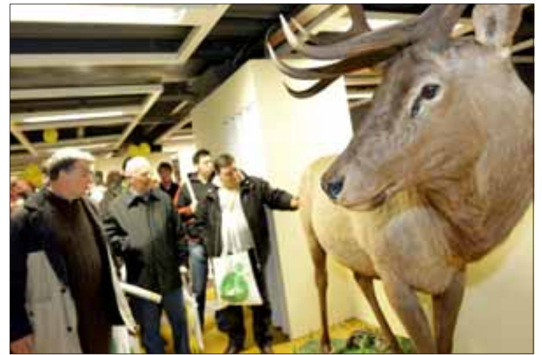
Hunting and fishing show will be held in vicenza Feb. 21-23.

Antique Market , Feb. 22, Piazzola sul Brenta, (PD), Villa