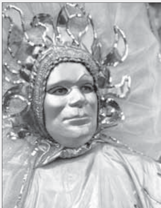
Carnevale is filled with elaborate costumes often parading through the crowds of onlookers.